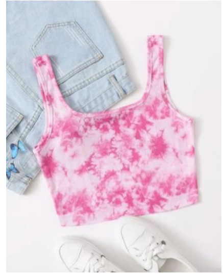
Tie-Dye Tee and Sweatpants set $24.00, Tie-Dye Sweatpants $16.00, Tie-Dye Cropped Tank $5.00

For a more expensive budget check out www.wildfox.com