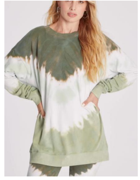
Tie-dye Cargo Sweatpants $148.00, Tie-dye leggings on sale for $39.20, Tie-dye oversized crew $128.00

Supplies to do it on your own can be purchased from stores like Target, Walmart and Michaels or even Amazon starting at $2.99 and clothing to dye can be any old things lying around, thrifted or purchased from any of your favorite stores.